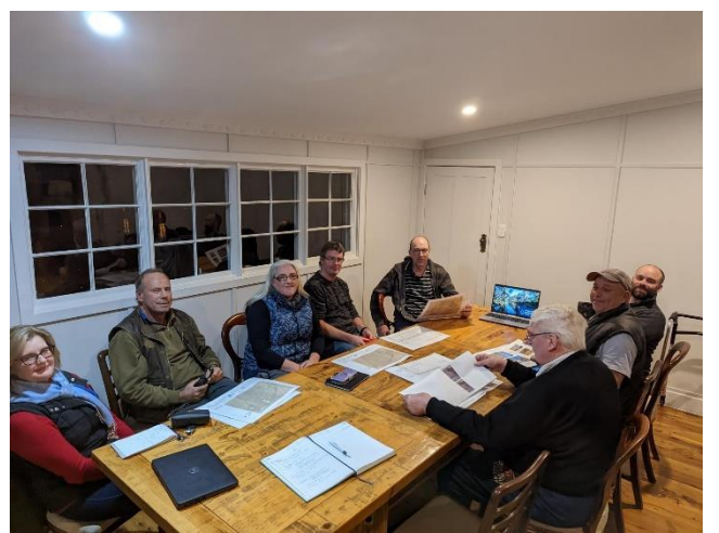
Above: Stakeholder Consultative Committee members at the July meeting

The Committee's feedback has helped us to prepare for the Community Sessions we are hosting this month and we are grateful for the assistance provided.