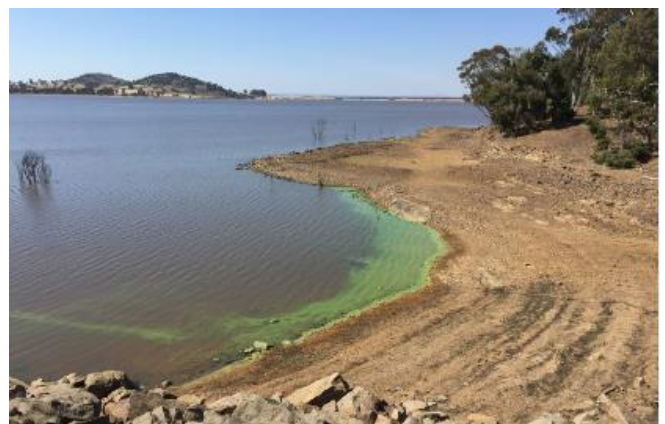
Blue-green Algae scum at Cairn Curran Reservoir

Chemicals and algae can also alter the taste and smell of water.