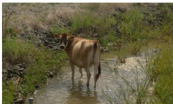
Prevent livestock access to channels and waterways