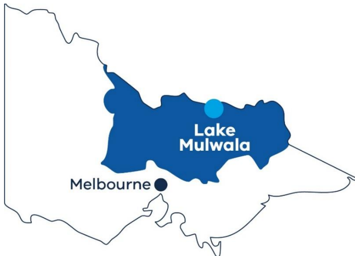
Figure 1 Yarrowonga Weir (Lake Mulwala) location map

Yarrowonga Weir is situated on the traditional lands of the Yorta Yorta people, on the Murray River. It is between the nearby towns of Yarrowonga in Victoria and Mulwala in New South Wales. The weir forms Lake Mulwala to the east.