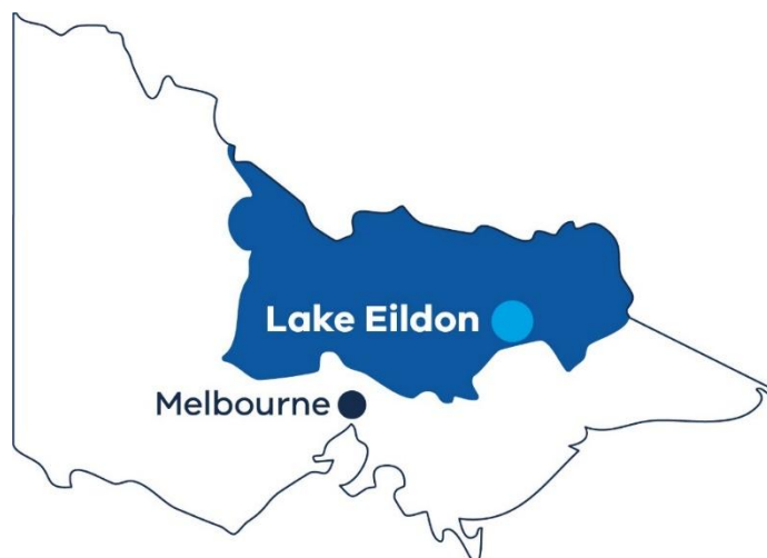
Figure 1 Lake Eildon location map

Lake Eildon is known as the Gateway to the High Country. It is located between Mansfield and Alexandra and is a two-hour drive from Melbourne. The lake has a 515 km shoreline, much of which is abutted by Lake Eildon National Park.