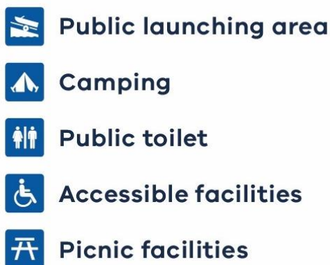
Figure 2 Facilities

The following facilities are available at Laanecoore Reservoir, with locations shown on the map in Figure 3.