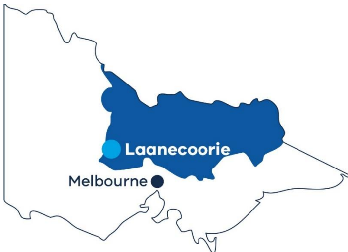
Figure 1 Laanecoore Reservoir location map

Laanecoore Reservoir is in central western Victoria, in the Loddon Valley. It is 40 km southwest of Bendigo and 26 km northwest of the historic town of Maldon.