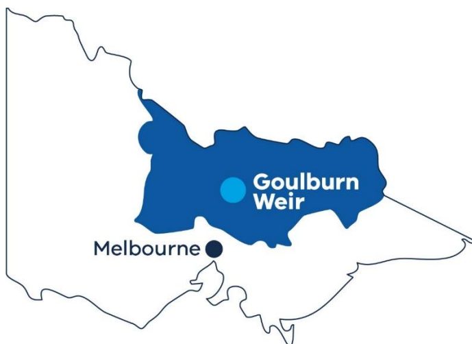
Figure 1 Goulburn Weir & Lake Nagambie location map

Goulburn Weir is located on the traditional lands of the Taungurung people on the Goulburn River, eight (8) km north of Nagambie, 35 km north of Seymour and 40 km south of Shepparton. Lake Nagambie, formed upstream from Goulburn Weir, is immediately west of the town of Nagambie.