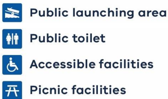
Figure 2 Facilities

The following facilities are available at Goulburn Weir and Lake Nagambie, with locations shown on the Goulburn Weir map at figure 3.