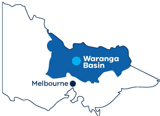
Figure 1 Waranga Basin location map

Waranga Basin is situated on the traditional lands of the Yorta Yorta and Taungurung peoples in central Victoria, between the Goulburn and Campaspe River basins. It is 8km northeast of Rushworth, 13km west of Murchison and 12 km southwest of Tatura and surrounded by agricultural land and state forest.