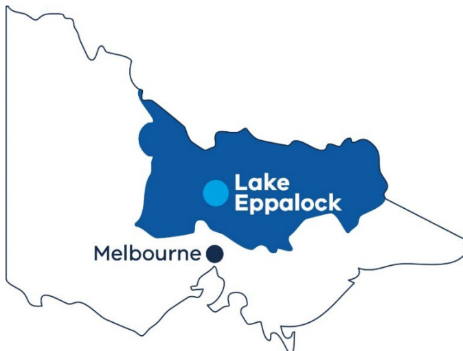
Figure 1 Lake Eppalock location map

It is approximately 20 minutes drive from Heathcote, 30 minutes from Bendigo and 90 minutes north west of Melbourne. The lake covers over 3,000 hectares and is the largest water storage in central Victoria.