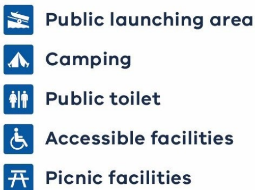
Figure 2 Facilities

The following facilities are available at Lake Eppalock, with locations shown on the map at Figure 3.