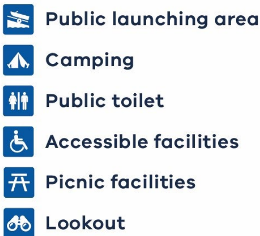
Figure 2 Facilities

The following facilities are available at Lake Eildon, with locations shown on the Lake Eildon map (Figure 3).