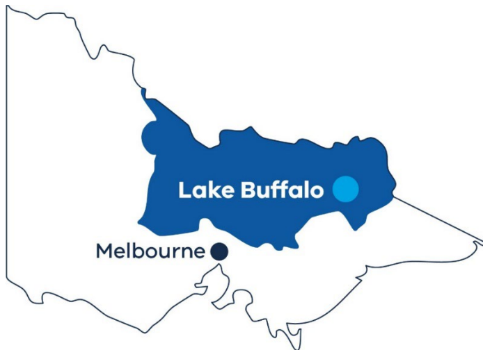
Figure 1 Lake Buffalo location map

Lake Buffalo is situated on the traditional lands of the Taungurung people, on the Buffalo River. It lies at the foot of the western slopes of Mount Buffalo National Park. The town of Myrtleford is 20 km to the north.