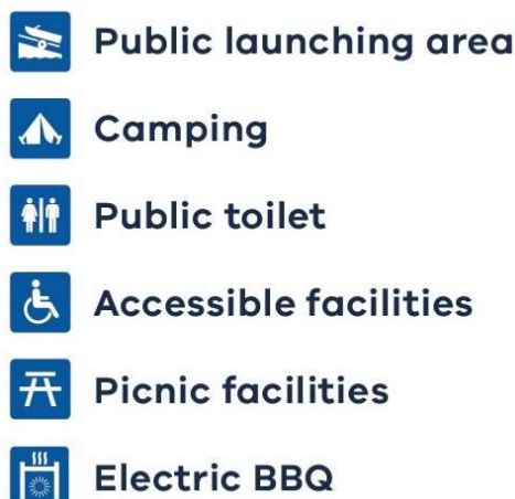
Figure 2 Facilities

The following facilities are available at Waranga Basin, with locations shown on the map at Figure 3.