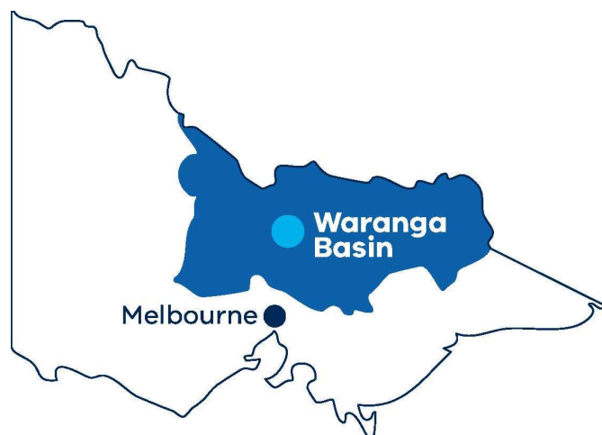
Figure 1 Waranga Basin location map

Waranga Basin is situated on the traditional lands of the Yorta Yorta and Taungurung peoples in central Victoria, between the Goulburn and Campaspe River basins. It is 8km northeast of Rushworth, 13km west of Murchison and 12 km southwest of Tatura and surrounded by agricultural land and state forest.