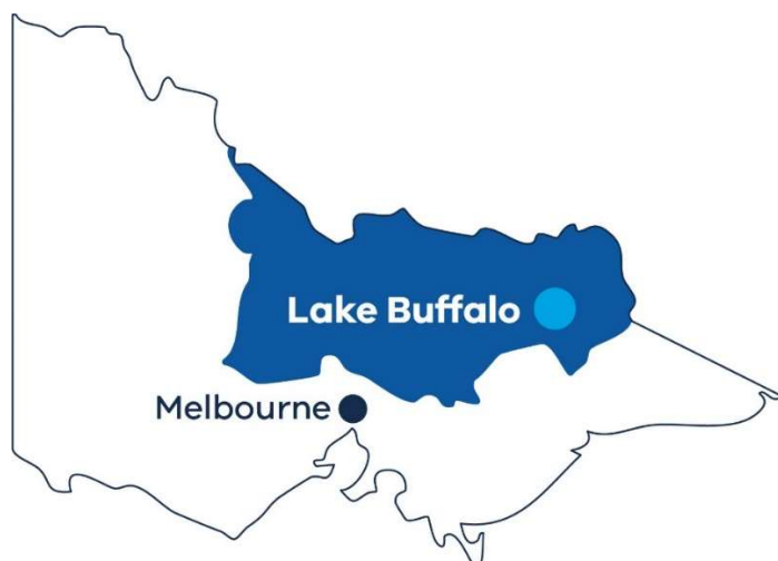
Figure 1 Lake Buffalo location map

Lake Buffalo is situated on the traditional lands of the Taungurung people, on the Buffalo River. It lies at the foot of the western slopes of Mount Buffalo National Park. The town of Myrtleford is 20 km to the north.