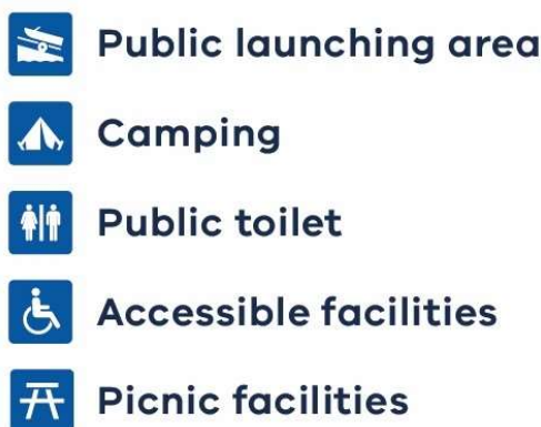
Figure 2 Facilities

The following facilities are available at Lake Buffalo, with locations shown in Figure 3.