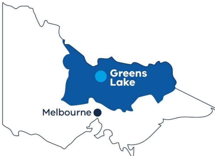
Figure 1 Green Lake Location Map

Greens Lake is situated on the traditional lands of the Taungurung people, about six (6) kilometres north-east of Corop in north central Victoria.