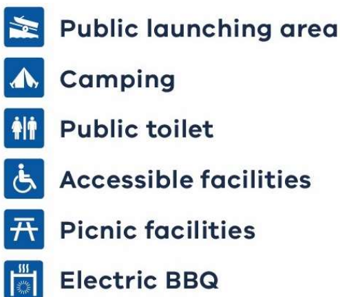
Figure 2 Facilities

The following facilities are available at Greens Lake, with locations shown in Figure 3.