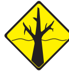
Above Water Hazard