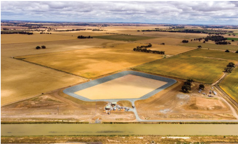
The Pump Station and Lagoon supplying the Mitiamo Pipeline with year round quality raw water.