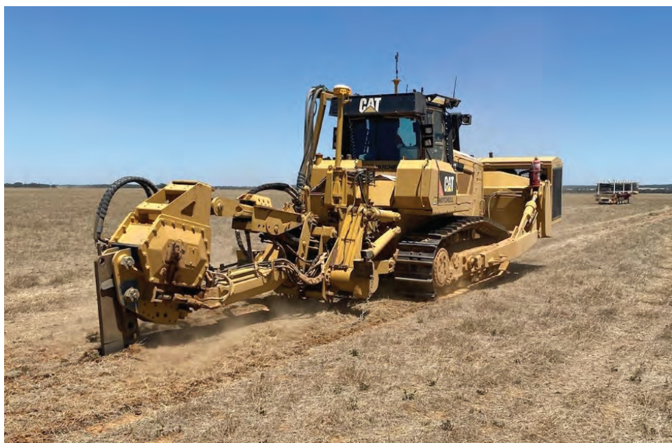
The Project team installing pipe using a bullet plough near Mitiamo

The project remains on track for completion in mid 2021.