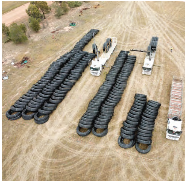
Locally manufactured pipeline stockpiled ready for project construction