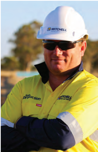
Mitchell Water Australia are proud to be awarded to construct the project

To ensure the construction team are ready to hit the ground running, GMW have procured 270km of the 360km of pipe and fittings for the project. The pipe was manufactured locally in Albury and has been delivered, ready for the crew to get started this month.