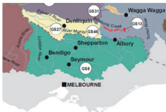
Figure 2: Goulburn-Murray Water Resource Plan Area for groundwater (GS8)

The Murray-Darling Basin Plan (Basin Plan) puts a cap on the total amount of groundwater allowed to be extracted in the Goulburn Murray Water Resource Plan area, shown as GS8 in Figure 2. The Goulburn Murray Water Resource Plan area (GS8) aligns with GMW's administrative area. Caps applied by the Basin Plan are called Sustainable Diversion Limits (SDLs).