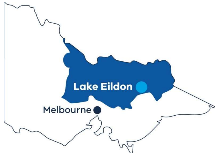
Figure 1 Lake Eildon location map

Lake Eildon is known as the Gateway to the High Country. It is located between Mansfield and Alexandra and is a two-hour drive from Melbourne. The lake has a 515 km shoreline, much of which is abutted by Lake Eildon National Park.