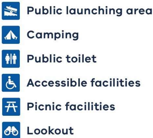
Figure 2 Facilities

The following facilities are available at Lake Eildon, with locations shown on the Lake Eildon map (Figure 3).