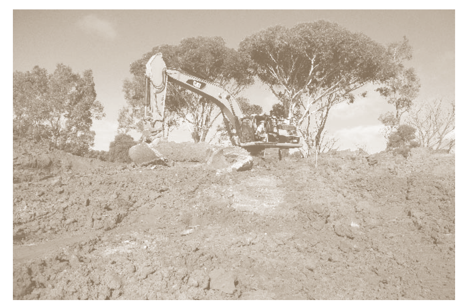
Replacing 5 subways along the Waranga Western Channel between the 74km and 85km regulators.

Winter works are currently underway in the Rochester Irrigation Area to help improve service delivery for the coming season. G-MW will replace five Waranga Western Channel Subways on McColl Rd between Restdown Rd and Brickchurch Rd this winter. Customers and members of the public are reminded to be mindful while moving around the works areas due to the increase in traffic.