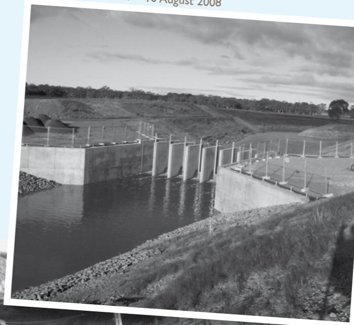
East Goulburn Main 16 August 2008

G-MW and NVIRP have committed to principles that service levels must be improved under the modernisation of the system. The channel systems will still have capacity limits and so in peak periods everyone still won't be able to access water at the same time. All customers will need to order deliveries; however, the notice required for delivery in most circumstances will be significantly reduced. The more notice you give the better the chance of getting water when you want it. When a channel is fully automated then confirmation of the order delivery will be instantaneous via WaterLINE.