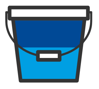
Murray, Goulburn and Campaspe systems are entitled to carryover 100 per cent of their high and low reliability water shares.