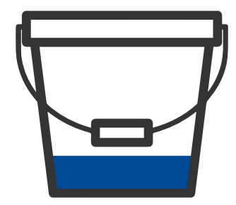
Broken system are entitled to carryover 50 per cent of their high reliability water shares.