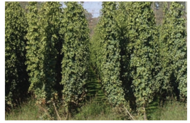
Hops grown in the Upper Ovens WSPA

The timing and duration of groundwater and surface water diversions changes the stream flow in the Upper Ovens catchment. Understanding how groundwater and surface