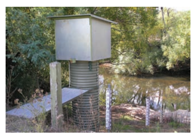
Stream flow gauge in the Upper Ovens River