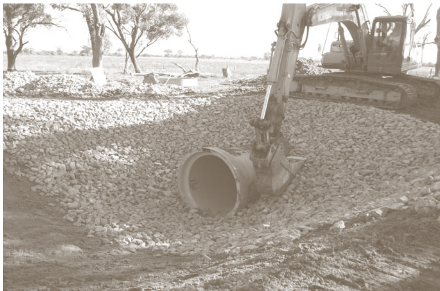
Replacing an occupation crossing on channel 17.

Customers and members of the public are reminded to be mindful while moving around the works areas due to the increase in traffic.